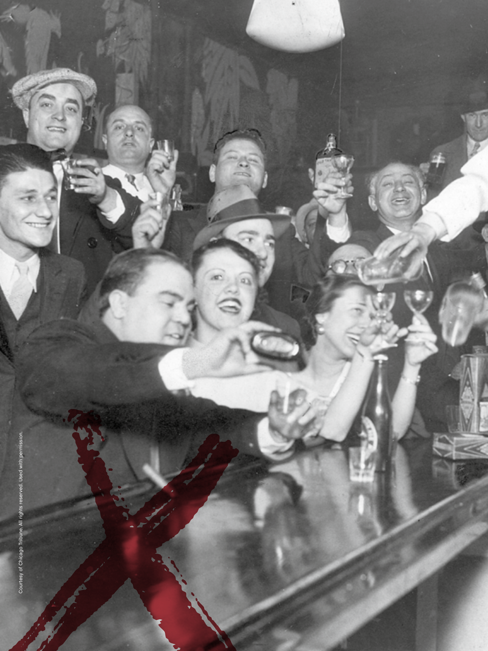
Courtesy of Chicago Tribune. All rights reserved. Used with permission.